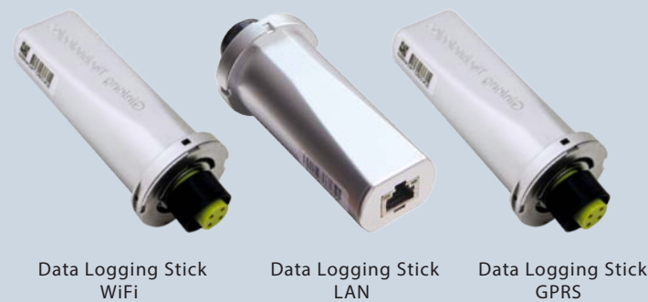
Data Logging Stick WiFi